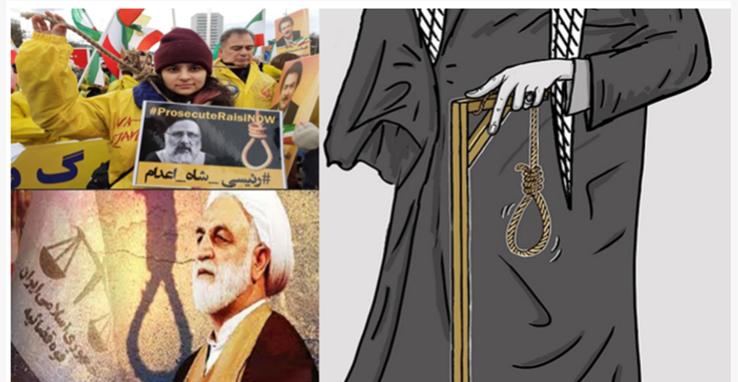
In face of a growing international wave of support for the Iranian people, driven by numerous domestic uprisings and four decades of organized Resistance, the regime's response has been to summon PMOI members by its judiciary, for its executions and torture.