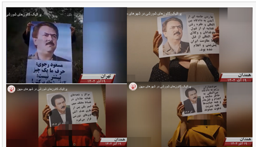
A Resistance Units member in Tehran, held a picture of Iranian Resistance leader Massoud Rajavi and a photo of him that called for regime leaders to present themselves at an international court “to answer for torture and executions and massacre in Iran.”

Having failed to destroy Iran's Resistance movement and prevent the new generation to join the