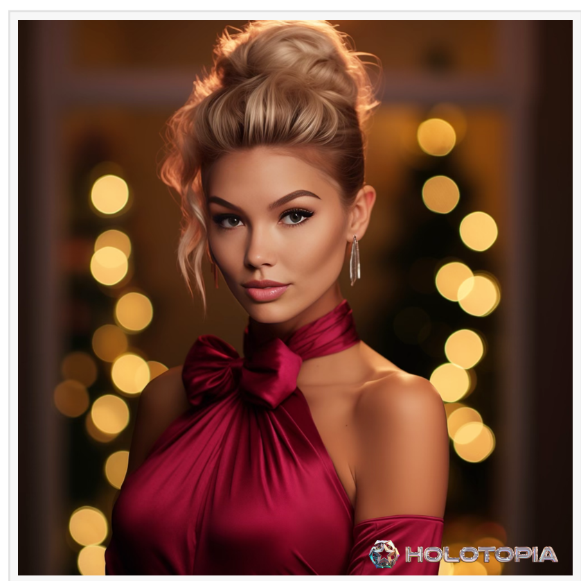
Spreading holiday cheer like confetti! Wishing you all a holly jolly season filled with love, laughter, and lots of festive fun! ? #HappyHolidays

Navigating the Ethical Landscape: The panel addressed the complexities of Al identity and verification head-on, acknowledging the potential risks of impersonation and the importance of safeguarding personal data. Rex Wong elaborated on the robust security measures in place, including a live Know Your Customer (KYC) process and the use of blockchain technology,