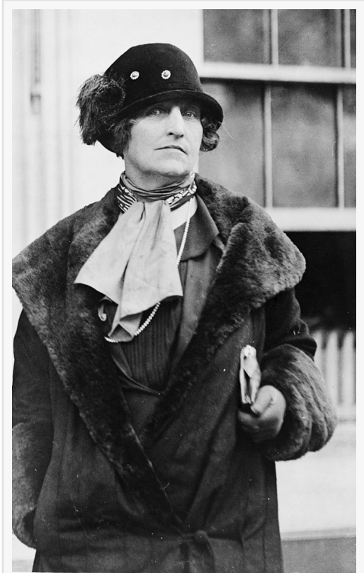
Winnaretta Singer Visits America