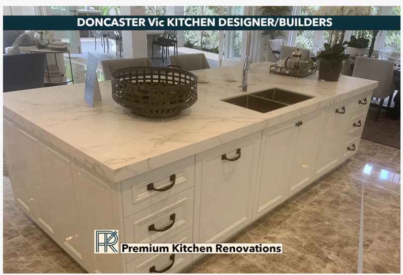
Doncaster Vic Kitchen Designer/Builder

Ergonomic designs with easy-to-reach shelves, lower countertops, and non-slip flooring are essential. These features ensure safety and ease of use, making the kitchen a welcoming space for all ages and abilities, while fostering independence and enjoyment in everyday tasks.