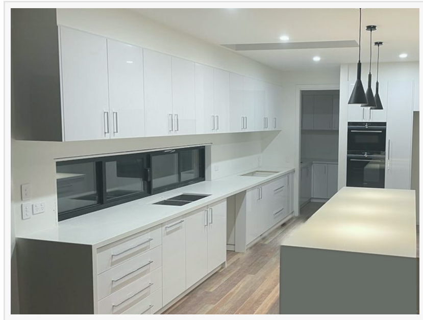
Kitchen By Premium Kitchen Renovations

so that they can cater to that sweet spot that resonates so deeply with each homeowner's unique lifestyle and values.