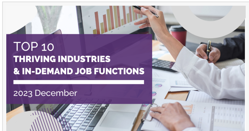
2023 December - Navigating Talent Trends Cover photo

The list below highlights the top 10 job