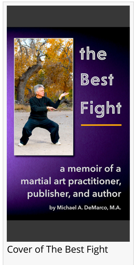
Cover of The Best Fight