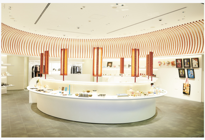
JMC brand shop interior

point for people from Japan and overseas who are departing from Haneda Airport, JMC will curate products that exhibit world-class techniques and sophistication as regionally revitalizing luxury Japanese brands, and at time of opening there will be approximately 400 products on display, including original products.