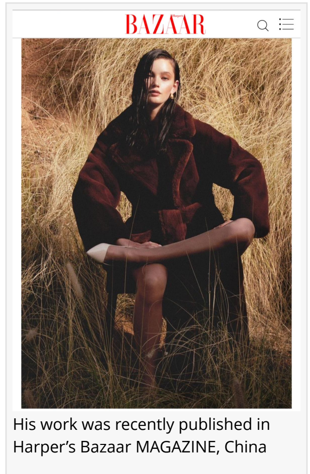
His work was recently published in Harper's Bazaar MAGAZINE, China

This press release can be viewed online at: https://www.einpresswire.com/article/677537466