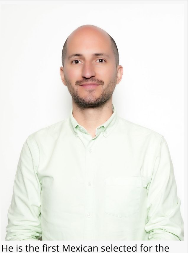
He is the first Mexican selected for the Global Media Makers L.A. Residency, supporting his upcoming feature film.