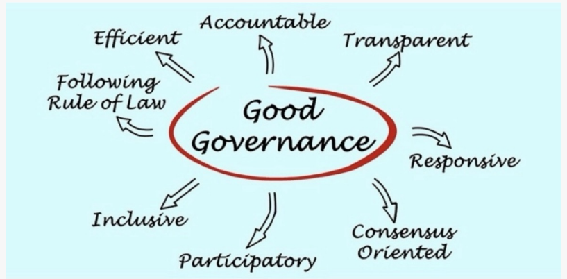
Governance, Risk and Compliance

Individuals wishing to submit financial facts and solutions may use this link to do so. The Task Force press release states, “If you or your organization is interested in improving government oversight, please share your specific solutions.” https://budget.house.gov/fiscal-accountability-whistleblower-submission