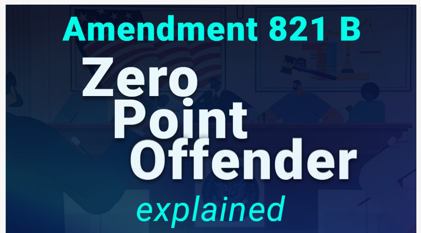
Zero Point Offender Video

The Zero Point Offender amendment , which became retroactive on November 1, 2023, allows eligible defendants and inmates with zero criminal history points to apply for downward adjustments to their sentencing guideline ranges. By meeting a set of criteria outlined in the amendment, these individuals have an opportunity to secure a two-level reduction in their offense level, resulting in a lower guideline sentence range, and ultimately a lower sentence.