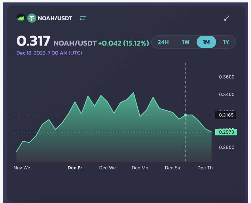
$NOAH Price from Pancakeswap