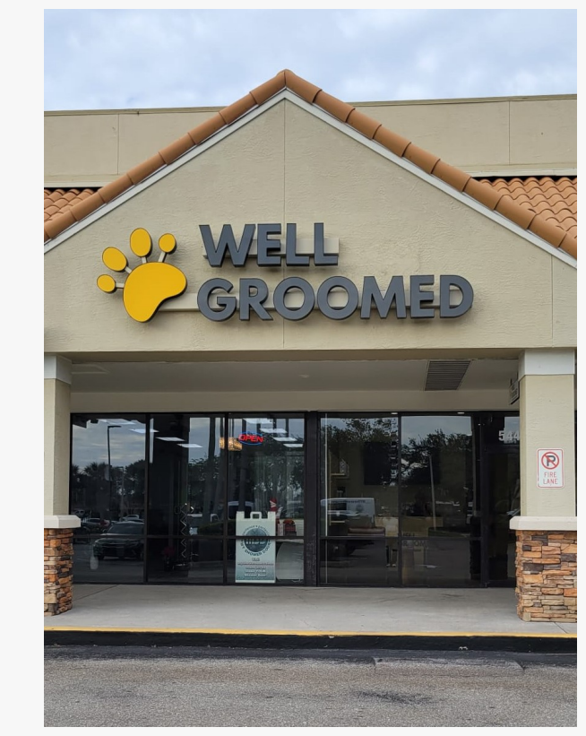
Well Groomed Pets - Sarasota

Improving every dog's quality of life: Well Groomed Pets prioritizes wellness for every dog by completing a comprehensive 54+ point wellness check throughout the entire grooming process and documenting the results in the dogs' digital record. This includes lump and lesion mapping and tracking.