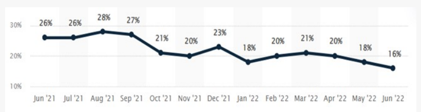
Congress Approval Graph, Statista 2022

This press release can be viewed online at: https://www.einpresswire.com/article/677824977