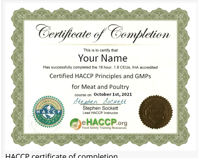
HACCP certificate of completion

eHACCP.org's HACCP training is accredited by the International HACCP Alliance, providing professionals with a globally recognized certification. This accreditation ensures that the training meets the highest standards of quality