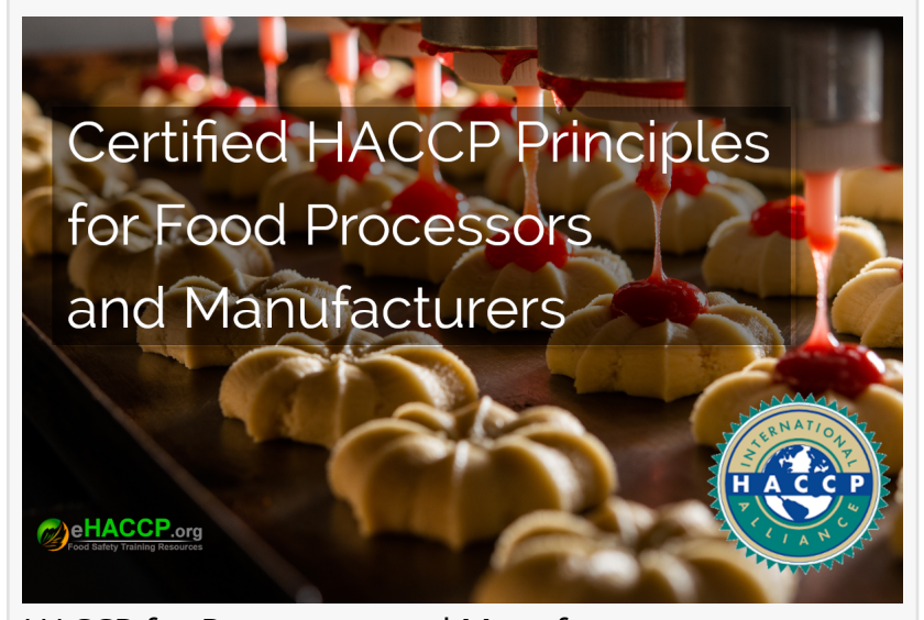
HACCP for Processors and Manufacturers