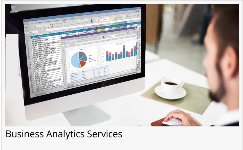
Business Analytics Services

EINPresswire.com/ -- The healthcare industry is known for its complexity and the challenges it faces in efficiently harnessing valuable insights from patient data. From appointment scheduling and patient record reviews to report generation and treatment planning, every facet of healthcare operations hinges on data availability. However, this vital information is often scattered across different departments within healthcare organizations, making it arduous to gain a comprehensive overview.