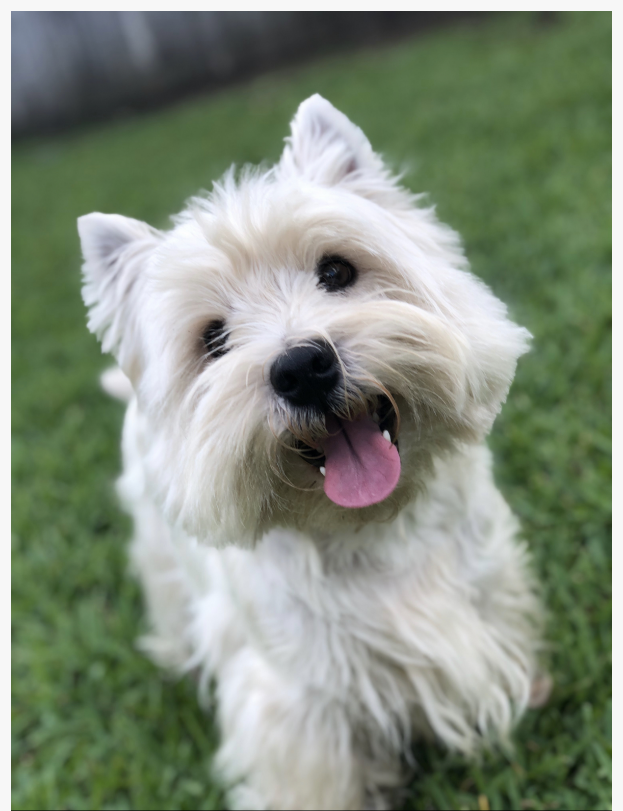
Westies may hold key to deadly human and canine diseases

Two of the most helpful tools available to Westie owners include a guidebook on important health issues -- the Westie Health Book -- and the WFA's newsletter. The current issue of the Westie Health Book is available on the WFA website. The newsletter, a source of research, health