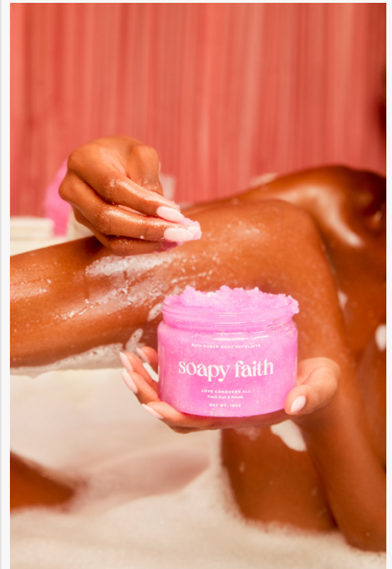
Soapy Faith Products

skin” " This principle embodies the brand's dedication to creating products that are not only tackle skin concerns but simplifying the journey to getting there, by offering a fun yet effective alternatives to those who often find themselves overwhelmed by the limitless options in the market.