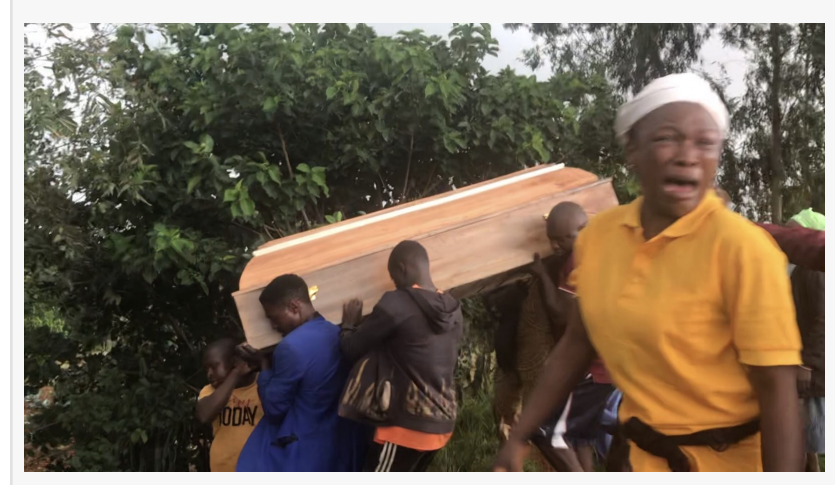
Burial of citizen guards in Nigeria.

"It is imperative that those responsible for these heinous attacks are held accountable," the U.S. authorities urged the Nigerian government while expressing "heartfelt condolences for the tragic loss of life."