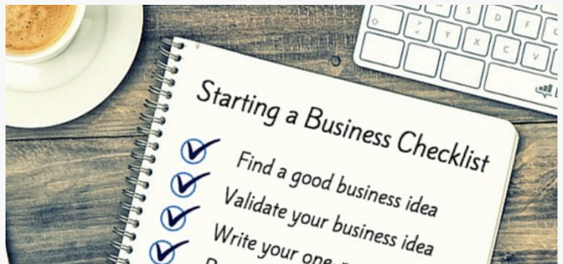
Startup Business https://llc.as.gov