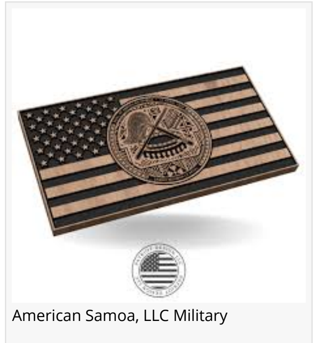
American Samoa, LLC Military

This press release can be viewed online at: https://www.einpresswire.com/article/678085380