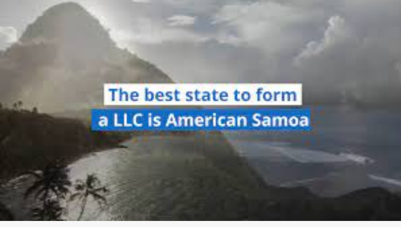
Best LLC in USA is American Samoa