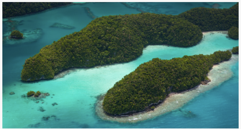
American Samoa USA