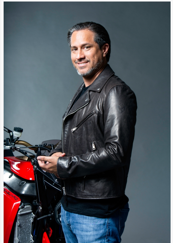
Soriano IV is the modern renaissance man we have all been waiting for.