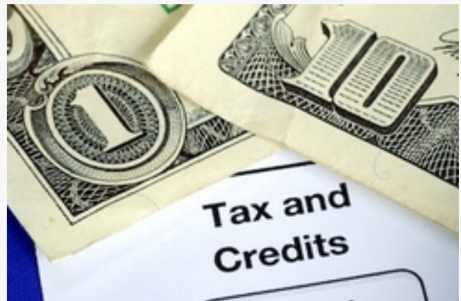
Child Tax Credit With No Income