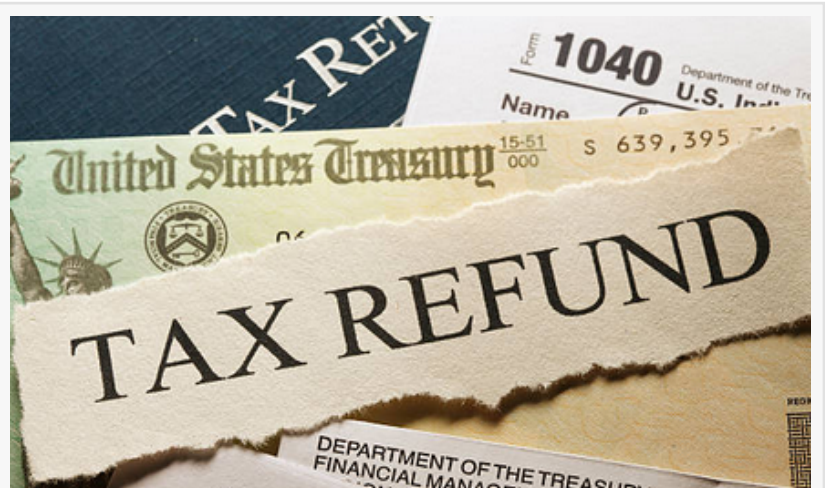
IRS Tax Refund With No Income

3. Earned Income Tax Credit (EITC) : The Earned Income Tax Credit remains a pivotal component