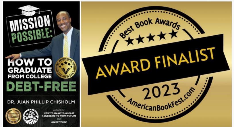
Mission Possible: How to Graduate from College Debt-Free as “Best Book Award Finalist”