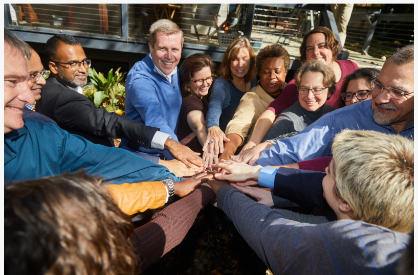
Kind and happy members of the Our Future is Kind community.

Our Future is Kind, the publisher of "In Kind: Consciously Craft a Meaningful Life and Career," offers individual and group coaching, workshops, and speaking engagements to support those aiming to build robust careers while creating a better future. The company is based in Chapel Hill, North Carolina.