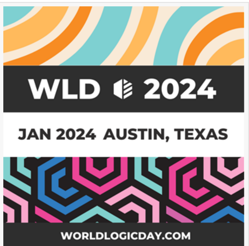
World Logic Day, Austin Texas 2024