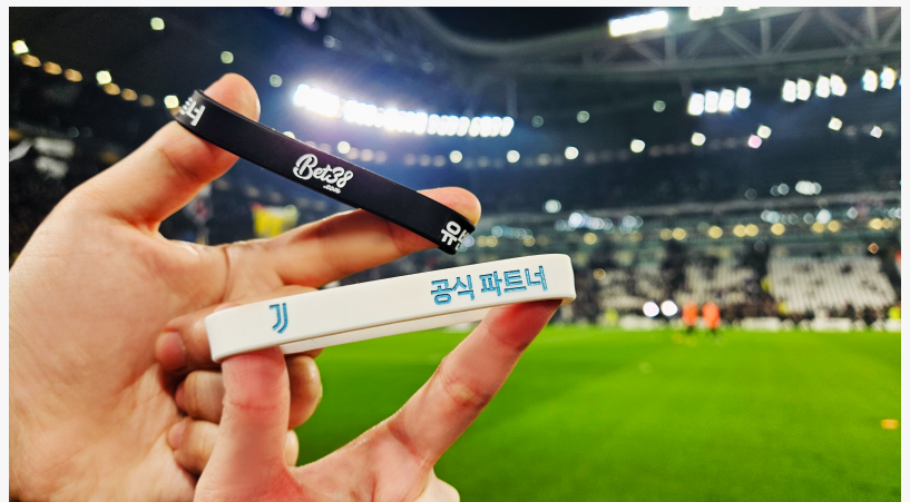
JUVENTUS PARTNERS WITH BET38

This press release can be viewed online at: https://www.einpresswire.com/article/678411180