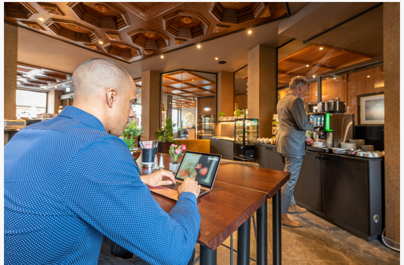
Coworking at Focus Lounge By KING's

As the world of business travel continues to evolve, Homes by KING's is at the forefront, offering sophisticated solutions for the modern traveller. With its blend of luxury, convenience, and community, Homes by KING's is transforming the extended stay experience in Munich.