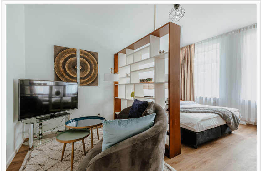
Homes By KINGS

Each apartment features high-speed internet, comfortable workspaces, and access to the Focus