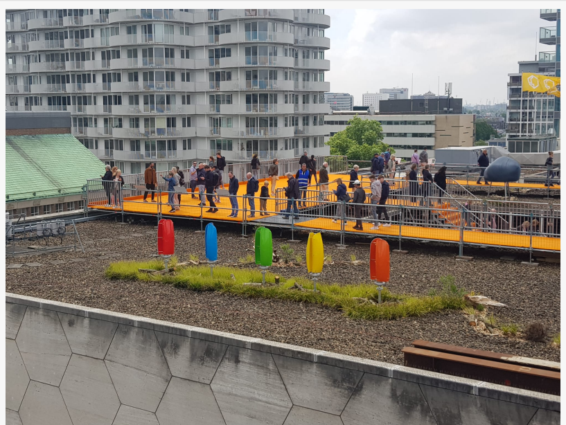
Flower Turbines at Rotterdam Roof Days

- Winner of the Dutch government sustainability award for two separate