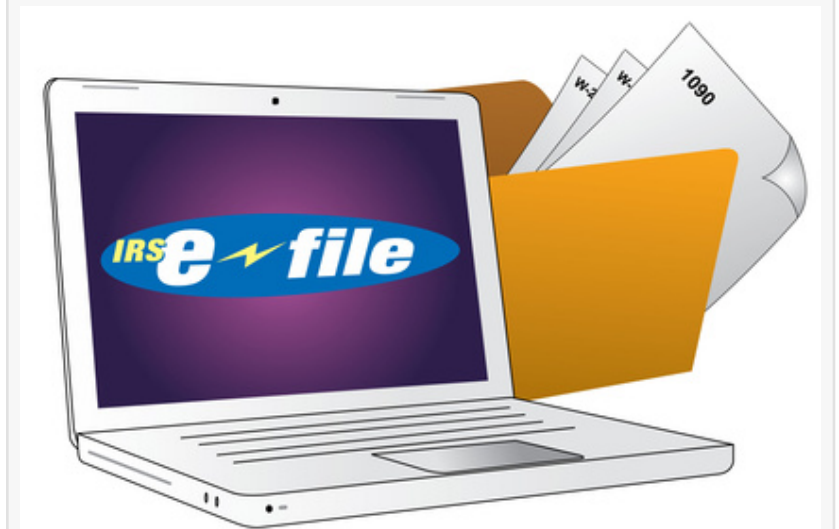
W2 Early Access