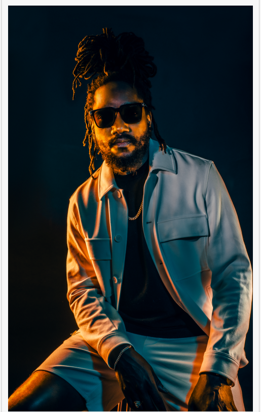
Kabaka Pyramid to perform at the Afro-Carib Festival 2024

For more Afro-Carib Festival information, please visit www.afrocaribfestmiramar.com or call 954-602-3178.