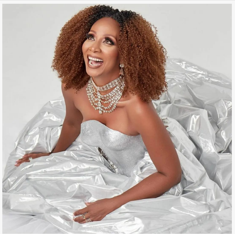
Nadine Sutherland to perform at Afro-Carib Festival 2024

This press release can be viewed online at: https://www.einpresswire.com/article/678662826