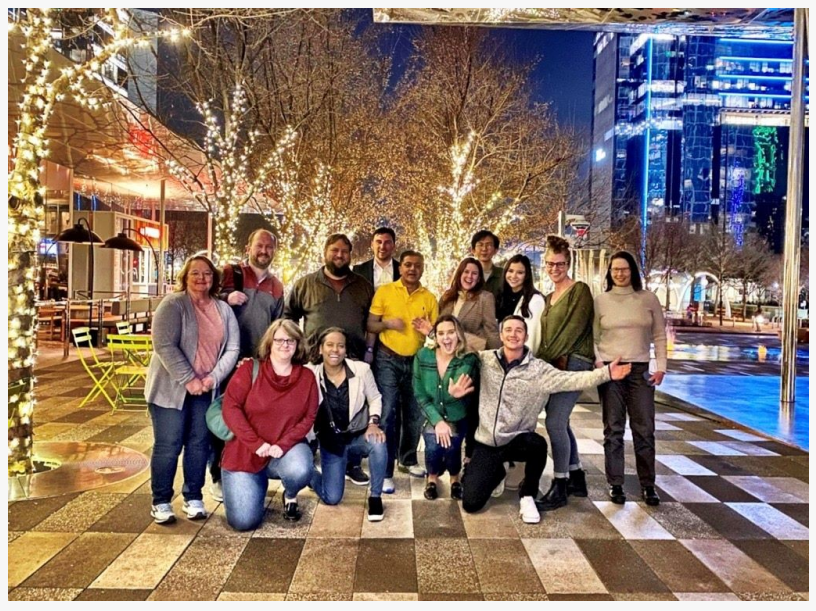
VertexOne Team Gather During Annual Leadership Meeting

About VertexOne VertexOne is the leading provider of cloud-based SaaS solutions, powering the next generation of customer experience for utilities, energy retailers and energy transition providers. With more than 30 years of experience and 400 customers in the cloud, we capitalize on our deep expertise to provide a wide range of innovative solutions for digital transformation, revenue optimization and data-driven efficiency operations surrounding the customer. From customer information systems (CIS) and mobile workforce management (MWM) to electronic data interchange (EDI) and self-service customer engagement portals, we empower our clients to deliver a compelling customer experience, reduce costs to serve, increase operational efficiency and improve customer satisfaction. For more information on how VertexOne allows you to enhance the digital customer