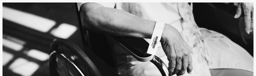
Pat-Track UHF Wristband on a patient

VERNA, GOA, INDIA, January 3, 2024 /EINPresswire.com/ -- Hospitals and healthcare facilities are often associated as high stress work environments where the staff, especially nurses have to do constant multi-tasking to achieve their caregiving goals. Nurses have to overcome constant distractions and multi-task to keep up with daily tasks, especially when wards are understaffed.