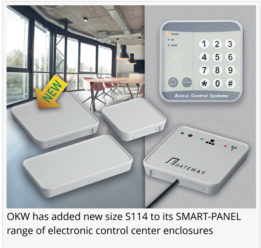
OKW has added new size S114 to its SMART-PANEL range of electronic control center enclosures

The enclosures have a highly polished bottom section with a flat, recessed area for interfaces such as USB or mini-USB. The top has a fine surface structure and is recessed to accommodate a touch screen or membrane keypad.