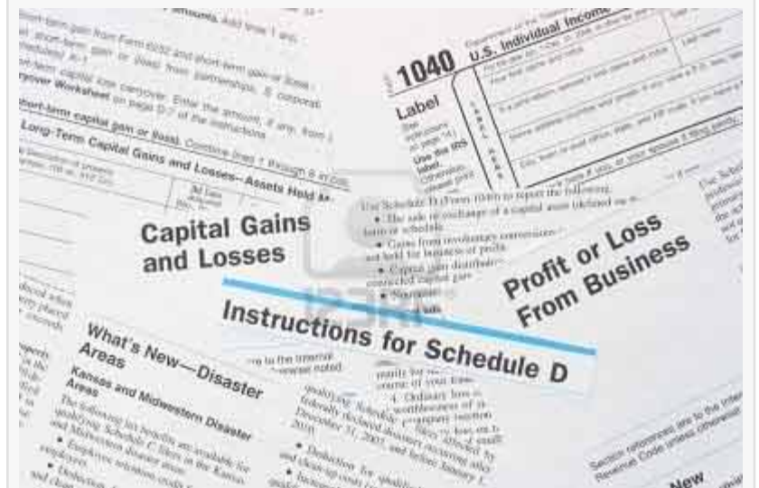
IRS 1040 Form Schedules

The instructions also provide information on which income sources should be reported on the