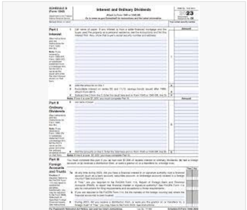
IRS Schedule B Tax Form

The updated instructions for the Schedule B form provide taxpayers with detailed guidance on how to complete the form accurately and avoid mistakes that could lead to penalties and interest charges.