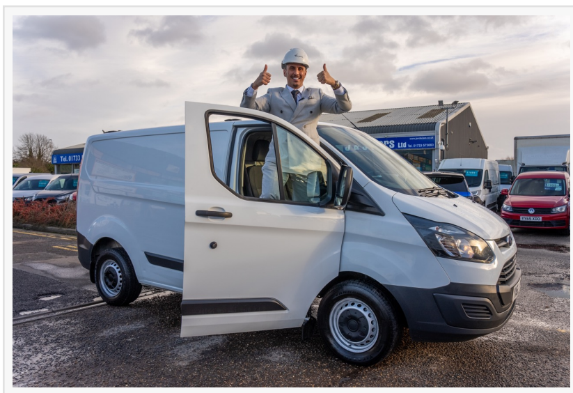
Attend a business training event in January for a chance to win this van

Commitment to Giving Back and Sharing the Essential Business Knowledge