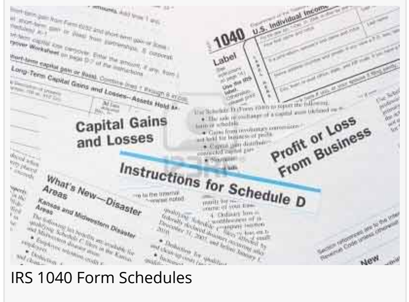
IRS 1040 Form Schedules