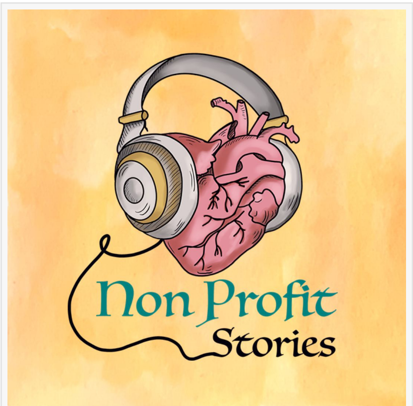
Non-Profit Stories: Inspiring Tales from Silicon Valley

The episode featuring Dee Dee Kiesow can be found on all major podcast platforms, including Apple & Spotify.