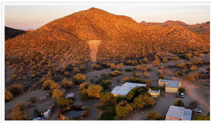
El Volteadero Overview

outdoor enthusiasts and investors to acquire a remarkable ranch and hunting property that offers world-class big game hunting and some of the finest dove hunting experiences in the region. On the weekend of January 18, 2024, you can tour the property and experience first-hand everything it offers.