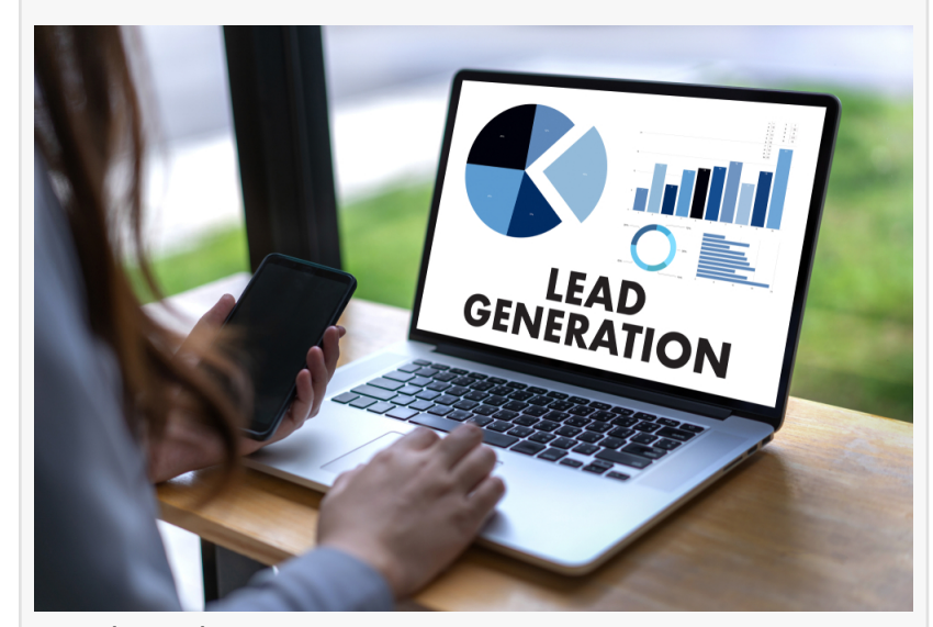
Local Lead Generation

flexibility ensures that each marketing strategy is as unique as the business it's designed for, providing a personalized path to success.