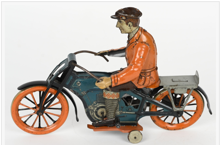
Rare German tin flywheel motorcycle, 9in long with spoked wheels and rider figure. All original with working flywheel mechanism. Estimate: $5,000-$7,000