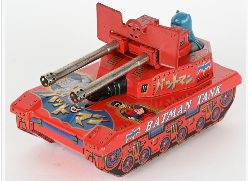
Yonezawa (Japan) tin friction Batman Tank, 8½in long. All original and complete with vinyl Batman driver. Estimate: $15,000-$25,000