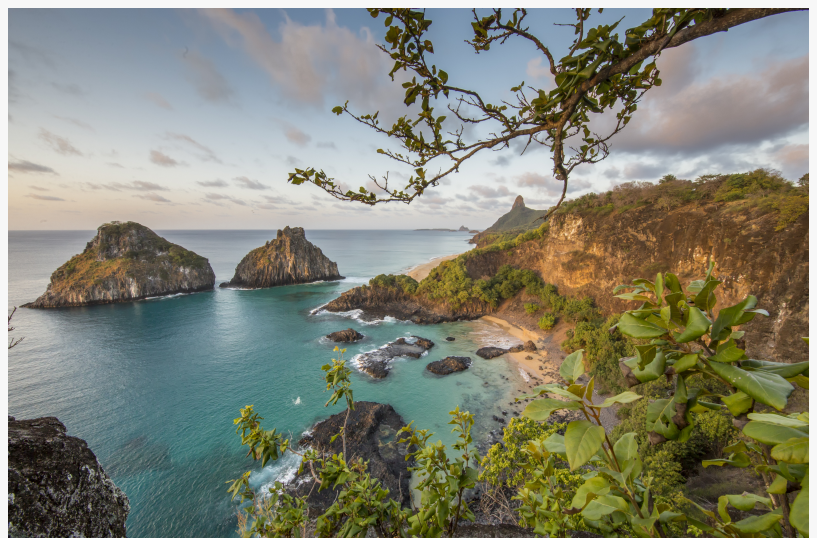
Fernando de Noronha Marina National Park in Brazil