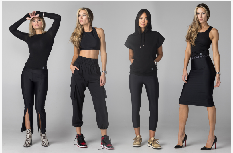
BDLab Sportswear Looks

PARK CITY, UTAH, USA, January 3, 2024 /EINPresswire.com/ -- Over a decade after taking triathlon fashion from boring to badass, Betty Designs aims to shake the sphere once more with BDLab Sportswear —a meticulously crafted line of fashion-forward apparel for the modern woman.