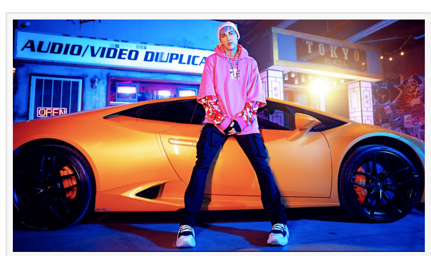
Chad Future, International singer, rapper, and music producer

LOS ANGELES, CA, UNITED STATES, January 24, 2024 /EINPresswire.com/ -- Since debuting in 2012, American K-Pop artist Chad Future has continued to experiment and blur the boundaries of K-Pop. Fusing a colorful palette of different styles, cultures, and inspirations effortlessly into a sound uniquely reflecting his own style. "Like That" marks his latest creation, a bright