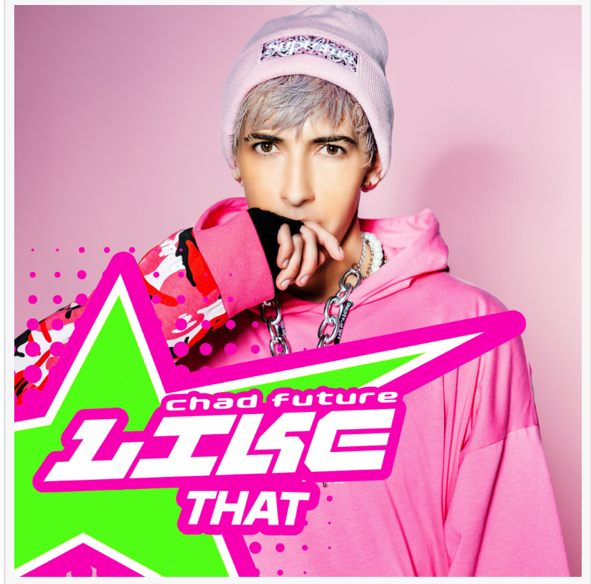
Chad Future, International singer, rapper, and music producer