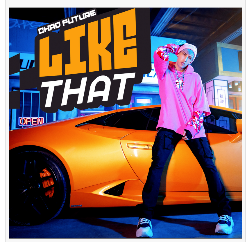
Chad Future - "Like That"