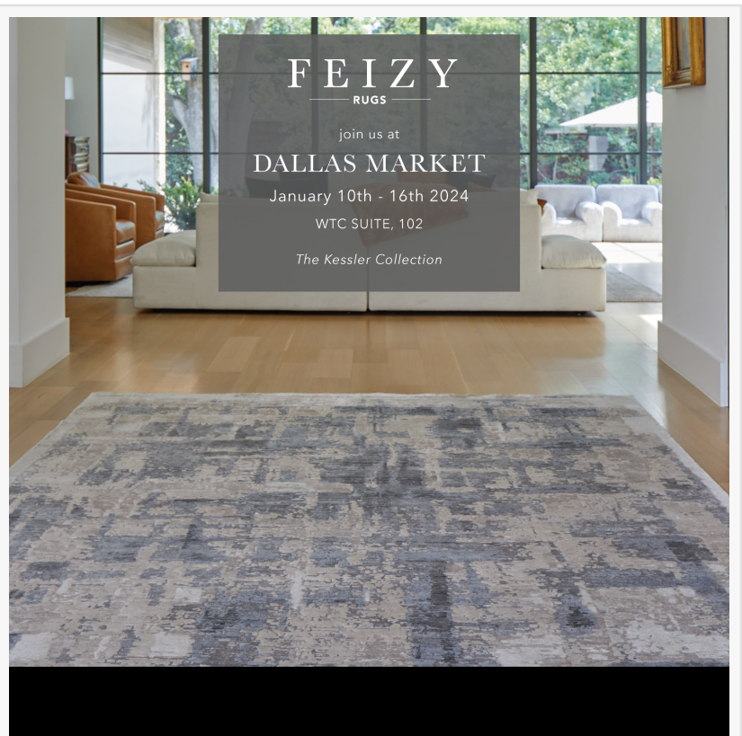
Feizy's expansive showroom at the Dallas Market Center is located in the World Trade Center bldg Suite 102.

This showroom is open by appointment and is located at 13800 Diplomat Drive Dallas, TX 75234."