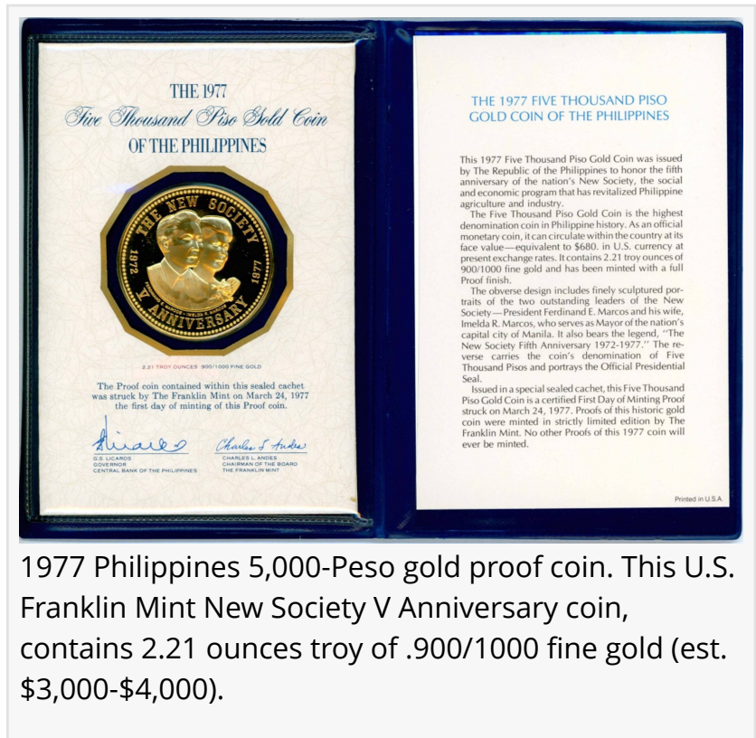
1977 Philippines 5,000-Peso gold proof coin. This U.S. Franklin Mint New Society V Anniversary coin, contains 2.21 ounces troy of .900/1000 fine gold (est. $3,000-$4,000).

To learn more about Bruneau & Co. Auctioneers and the 438-lot, online-only Winter Fine & Decorative Art auction on Monday, January 22nd at 10 am EST, visit www.bruneauandco.com .