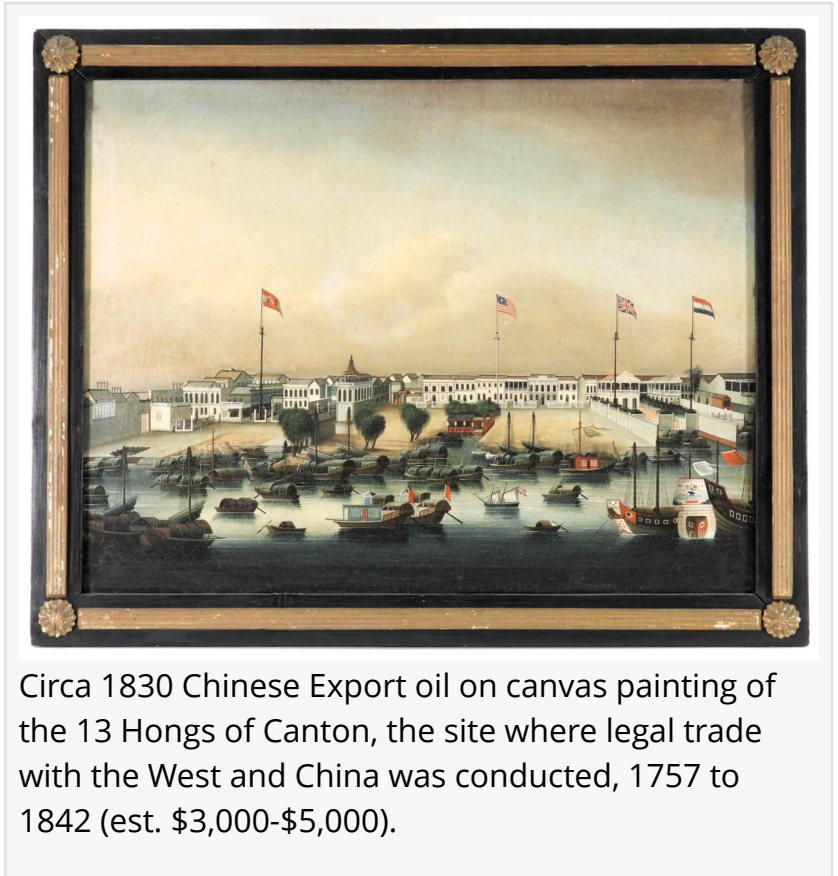
Circa 1830 Chinese Export oil on canvas painting of the 13 Hongs of Canton, the site where legal trade with the West and China was conducted, 1757 to 1842 (est. $3,000-$5,000).

The Crane painting, an oil on canvas depicting an open field with a small stream surrounded by a forest covered in fog, is expected to bring $2,000-$3,000. "It will be interesting to see the result on this fine impressionist work, in this ever-changing art market," Mr. Bruneau said. Crane