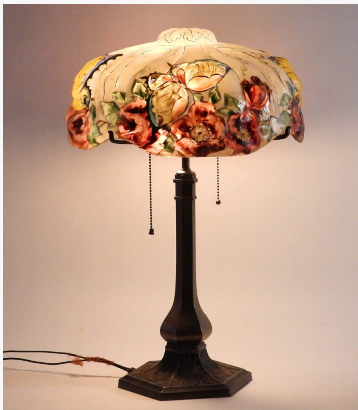
Early 20th century Pairpoint Puffy Papillion table lamp depicting yellow butterflies and red roses in the Papillion pattern over a two-light lamp, marked (est. $800-$1,200).