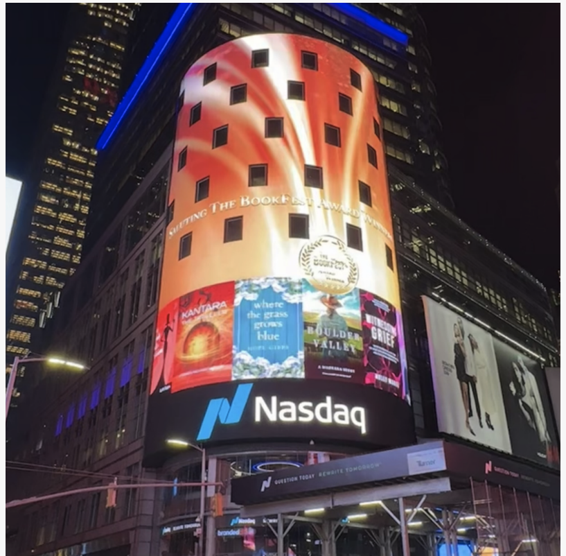
Times Square billboard