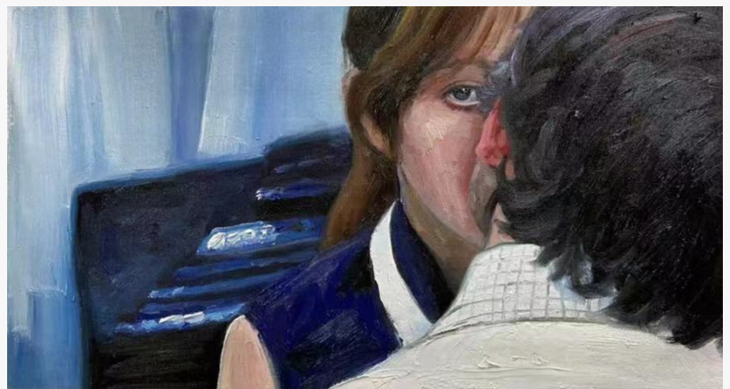
work of art