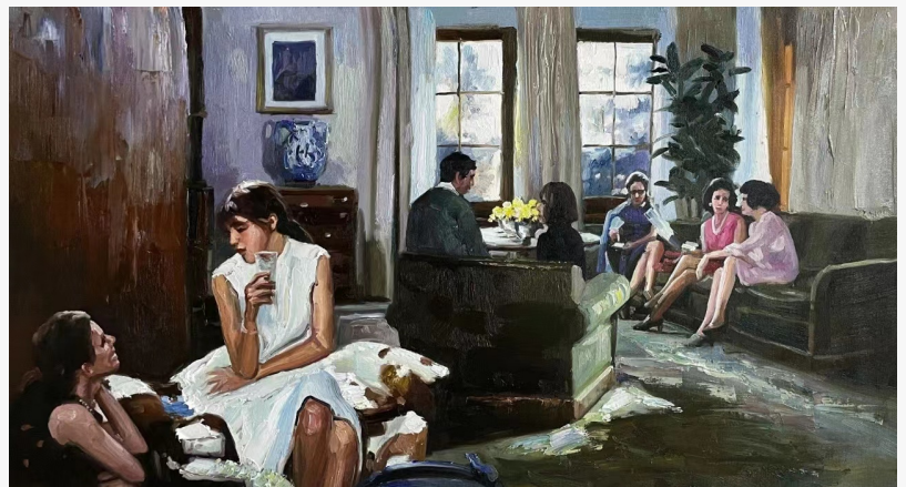
work of art