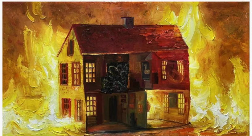
work of art